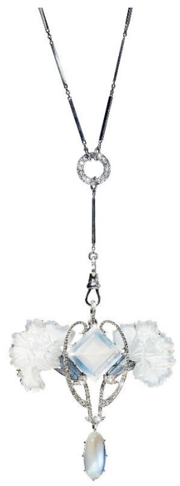
An Art Nouveau Moonstone, Diamond, Enamel and Glass Pendant, By René Lalique Estimate: $45,000-65,000