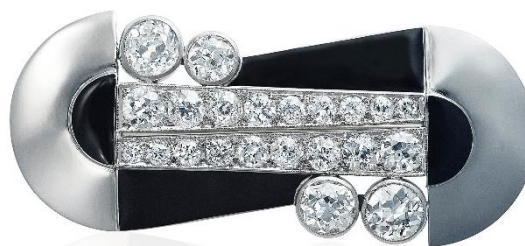
An Art Déco Diamond and Lacquer Brooch, By Raymond Templier Estimate: $45,000-65,000

Raymond Templier and La Maison Templier spans over three generations. The founder, Charles Templier opened a jewellery shop in Paris in 1849. His son Paul succeeded him and the company flourished under his direction. Paul's son Raymond joined after graduating from the École Nationale des Arts Décoratifs in Paris and he was the true artist of the family. Sketching at every moment, he would have filled his office floor by midday with sketches which would be evaluated in the afternoon. Raymond Templier's talent was celebrated, earning him the title of the "architect of Jewellery" and many articles on him appeared in applied art journals.