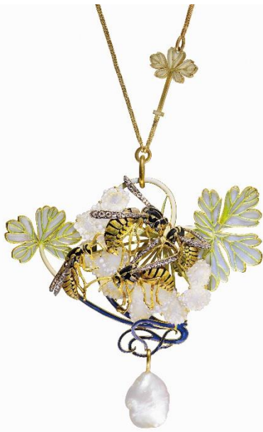
An Art Nouveau Enamel, Diamond and Pearl Pendent Necklace, By René Lalique Estimate: $90,000-130,000