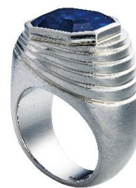
An Art Déco Sapphire Ring, By Raymond Templier Estimate: $25,000-35,000

The sapphire's octagonal-cut is sublime on lot 102 and the 1925 platinum work is characteristic of Templier, the metal is worked on multiple planes and forms waves, that give the piece a vibration, a rhythm (estimate: $25,000-35,000). The collection of Art Déco jewellery offers pieces signed by Jean Fouquet, son of Georges Fouquet, both innovative jewellers in Art Nouveau and Art Déco, as illustrated on the first page, a hexagonal onyx plaque pendant set with cabochon-cut emerald – representing the essence of Art Déco jewellery, made in 1925 (estimate: $90,000-130,000). The collection incorporates several works by Janesch, founded in 1835 in Trieste, with a second and very active branch in Paris; clocks and watches by Cartier, jewels by Ostertag, a house which was only productive from 1920-1940; two rings by René Boivin and Paul Brandt, a Swiss jeweller who settled in Paris and who became famous for his extremely modernist geometric jewellery., as well as an extraordinary vanity case by Van Cleef & Arpels of Persian inspiration, which opens to reveal a mirror, two compartments and a lipstick holder, made in 1927 (estimate: $45,000-65,000).