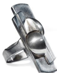
A Mid-20th Century Ring, By Fontana Estimate: $2,500-3,500

The abstract compositions and essential geometry of Art Déco (1915-1935) jewellery were daring and liberated, accompanied by vibrant chromatic contrasts and the innovative use of materials – coloured gemstones carved in the Indian style as flowers and leaves, or calibré cut in exotic shapes. Jewellers united East and West and formed with colour a synthesis of pure art and lasting luxury. Abstract, industrial shapes became increasingly massive and almost architectural in form as colour crept away from jewels to leave entirely white expanses of platinum, diamond and rock crystal or clean contrast of diamond and just one other colour. Sleek geometry gradually softened into more sculptural, three-