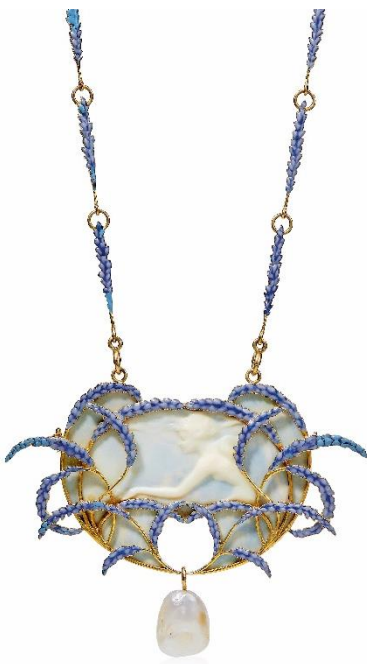
An Art Nouveau Galalith, Enamel And Pearl Pendant Necklace, By René Lalique Estimate: $45,000-65,000

Whether it was magnificent creations for Mr. Calouste Gulbenkian or smaller jewellery pieces, all Lalique items could easily be worn since none were rigid, and they were almost invisibly supple. Lalique thought first and foremost of the person who was to wear his pieces – his creations are always soft against the skin, with the back as beautifully mastered as the front.