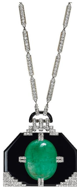
An Important Emerald, Onyx and Diamond Pendent Necklace, By Georges Fouquet Estimate: $90,000-130,000

New York/Geneva/Paris – As announced at the end of July, Christie's has been entrusted with the sale of masterworks from an important European private collection, Beyond Boundaries: Avant-Garde Masterworks from a European Collection which will be offered throughout the second half of 2017 in New York, Geneva and Paris. This ground-breaking collection was assembled by a couple with a keen eye for rare exceptional works of arts and design. Expected to achieve around $30,000,000 and comprising around 180 works from five categories: Impressionist and Modern Art, Post-War and Contemporary Art, Magnificent Jewels, African Art and Design.