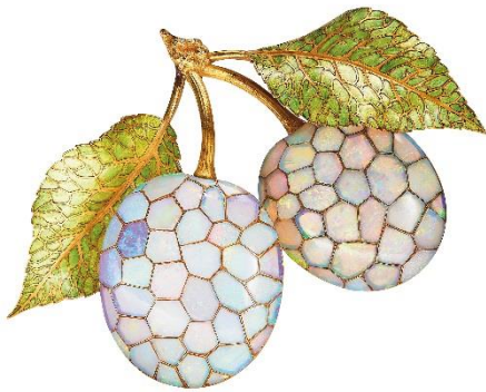
An Art Nouveau Opal and Enamel Brooch, By René Lalique Estimate: $90,000-130,000

Each of the 110 Art Nouveau and Art Déco jewels is a treasure in itself and reflects the passion of a collector, who surprised his wife with beautiful jewels from the beginning of the 20th century.