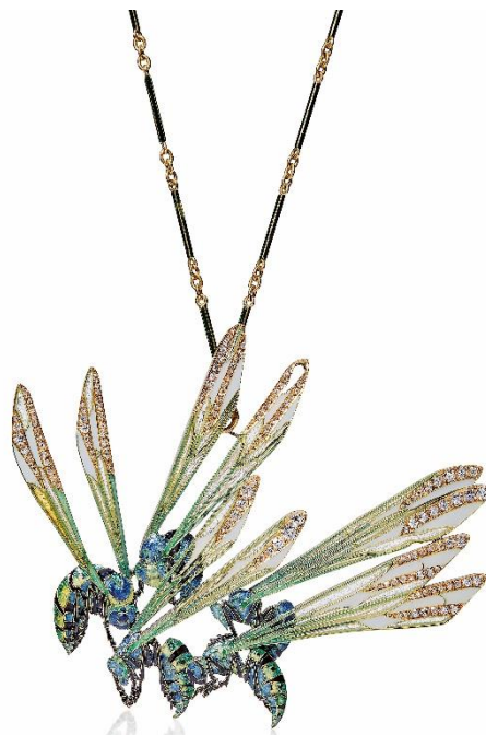
An Art Nouveau Enamel and Diamond 'Wasp' Pendant/Brooch, By René Lalique Estimate: $60,000-80,000